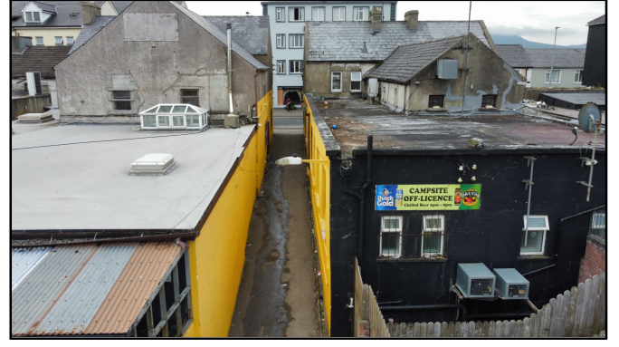
MEEHAN'S LANE AERIAL IMAGE - 02