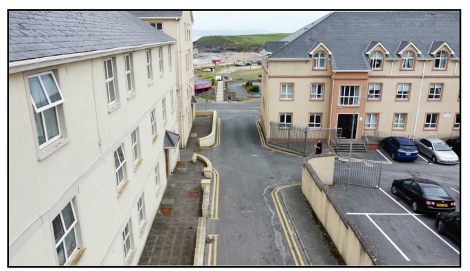
MEEHAN'S LANE AERIAL IMAGE - 01