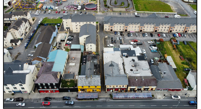
MEEHAN'S LANE AERIAL IMAGE - 03