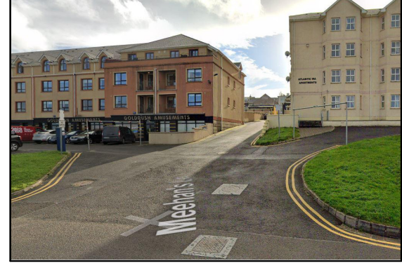
MEEHAN'S LANE ATLANTIC WAY ENTRANCE