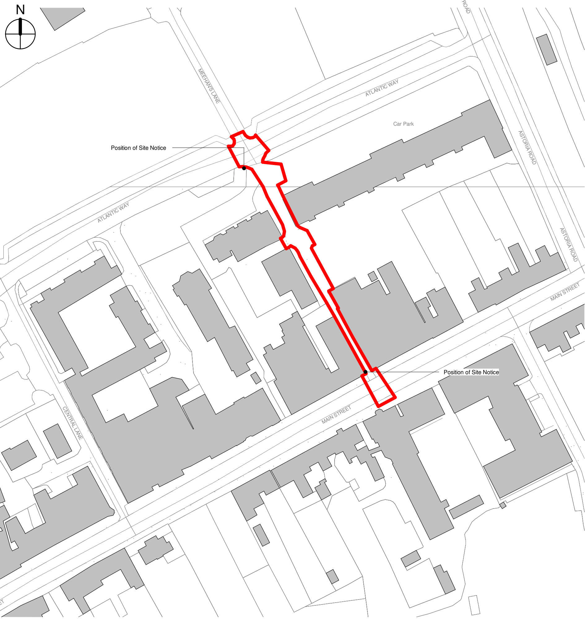
Meehans Lane Site Location Map 1 : 1000